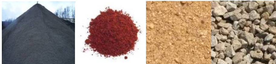
Fig1. Composition of Materials

Figure 1 shows the different materials that are used for the preparation of concrete.